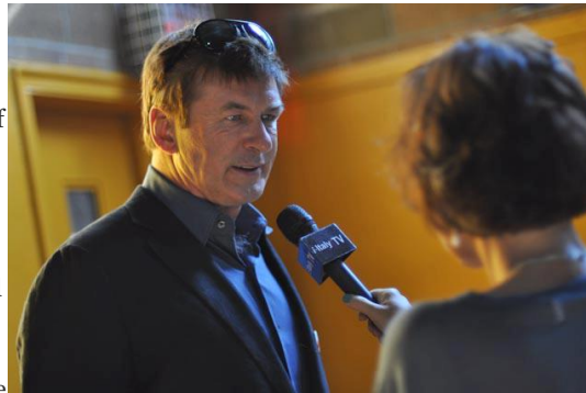
i-Italy video interview with Alec Baldwin