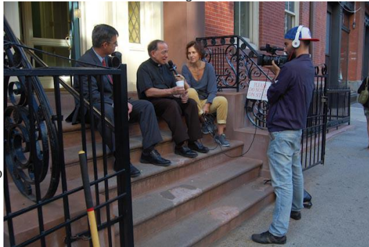
i-Italy video interview with monsignor Sakano