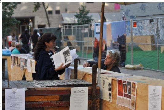
Books come with the "Italian American Writers Association"