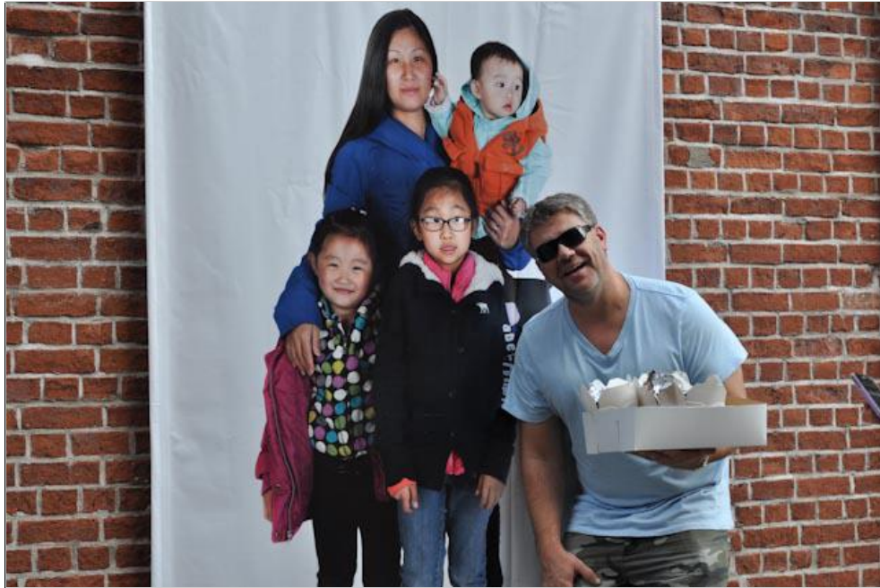
More on i-Italy Facebook Page on i-Italy Facebook Page

Mulberry Street between Houston and Prince. Something different is happening there and it coincides with the traditional celebration of the feast of San Gennaro in Little Italy until September 23. Come and see for yourself!