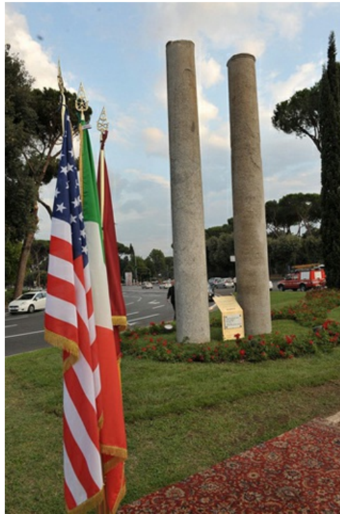
The two marble columns representing the Twin Towers.