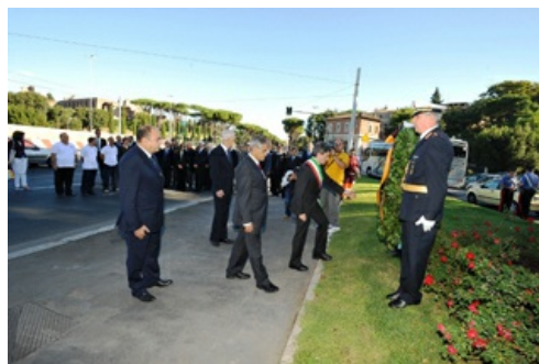
Inauguration ceremony in Rome.