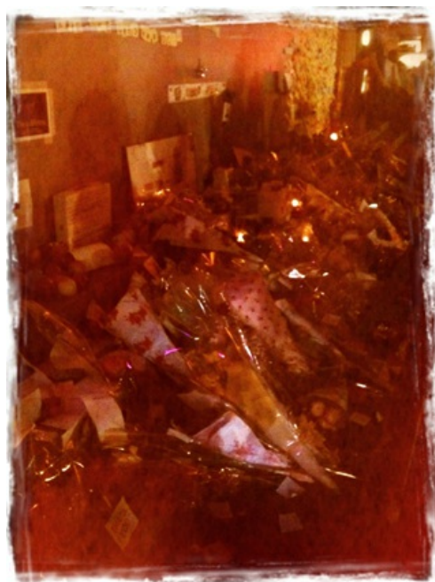
Homage to the victims of 9/11.