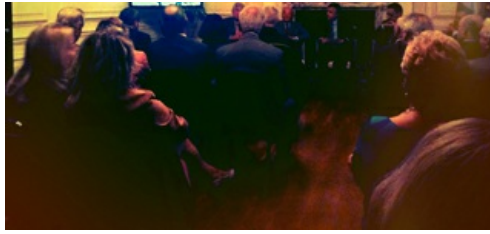
The conference at the Consulate in New York.