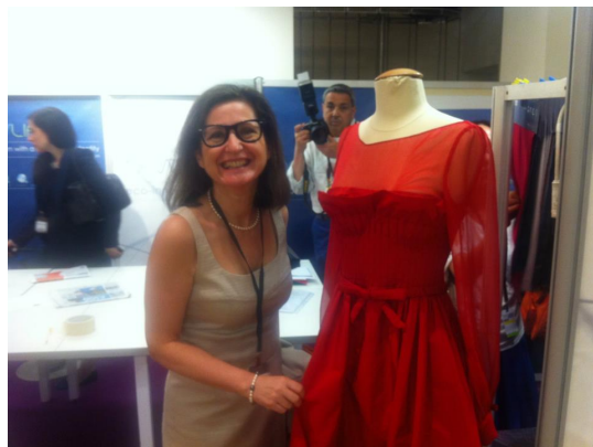
Consul General Natalia Quintavalle with a Valentino dress made of recycled polyester