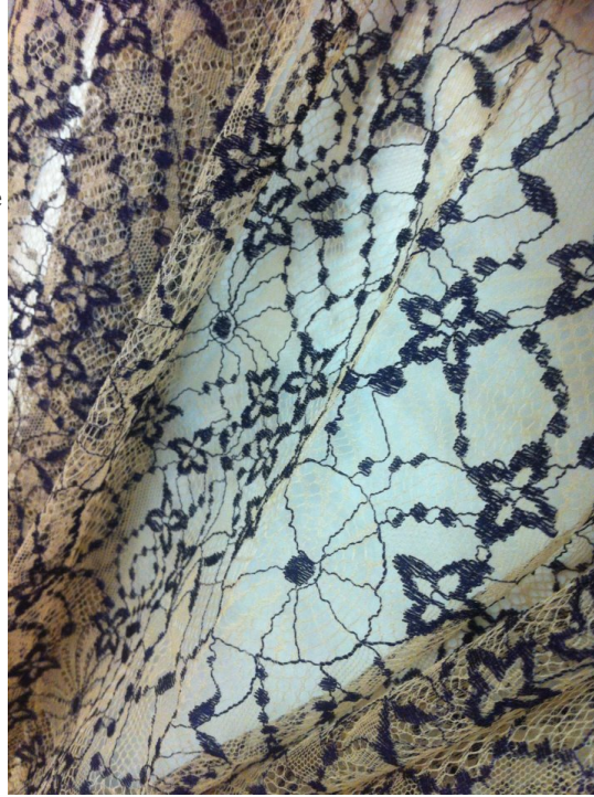
Italian Lace by Pizval