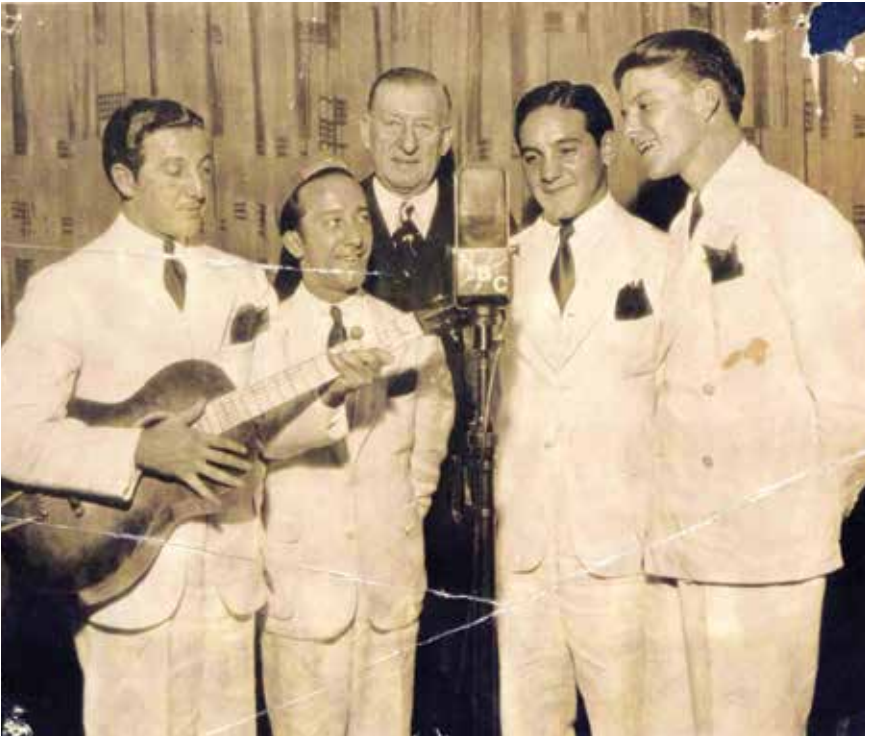
The Hoboken Four at a Major Bowes Amateur Hour radio broadcast, 1935

The Helene Fortunoff Theater, Monroe Lecture Center, California Avenue, South Campus